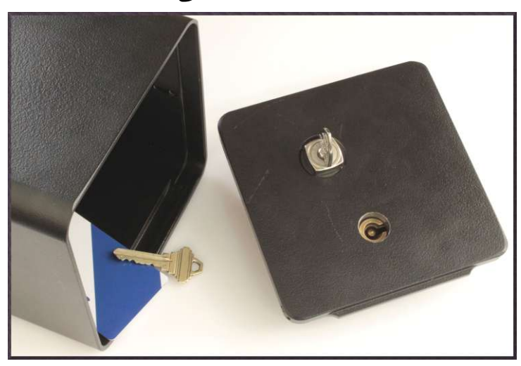
L6000CP Dual Key Post Office Micro-Switch Vault